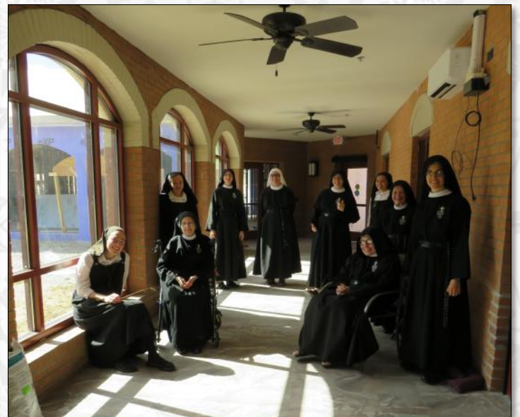
The loggia (connector to the new wing) is almost finished. Handicap accessible doors will give wheelchair access to the walkway and Holy Family Wing.