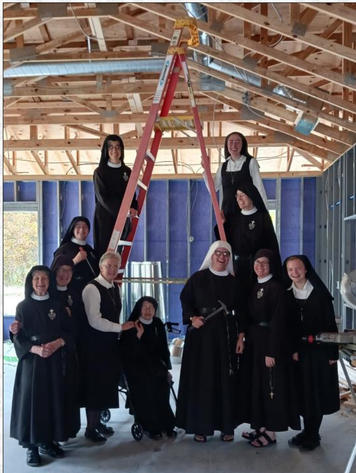
Above: An after-hours invasion of the Holy Family Wing. Contractors away - the nuns will play! Right: Excavation begins for the new covered patio for retreatants off the retreat house dining room. Sheltered seating and dining for our guests, a long-time dream, is coming true. Outdoor lake-view seating and an awning for the retreat house entrance are also in the works.