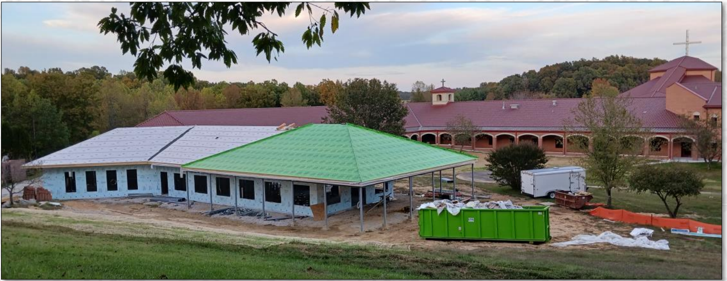
We'll be looking at a green roof until next spring when the Spanish clay tiles will be delivered and installed.