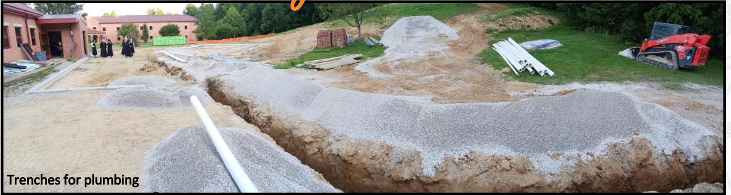
Trenches for plumbing