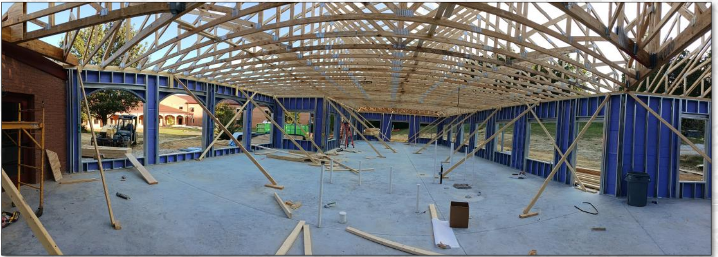
Holy Family Wing walls and framing were done in a week!