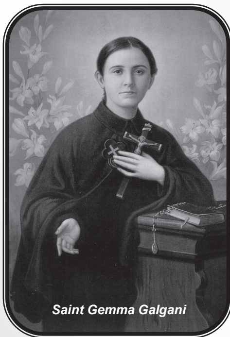
Saint Gemma Galgani

We began using them by having them on the altar and asking for their intercession for those that came up to receive prayer. Since the numbers of people were so large, we soon after had teams of lay people use the 9 relics that we had to pray over other people. Before people came up to receive prayer, we had them verbally repent of their sins, forgive anyone they needed to, and repent of evils in their life. We wanted to teach them that spiritual healing is the primary healing we should seek.