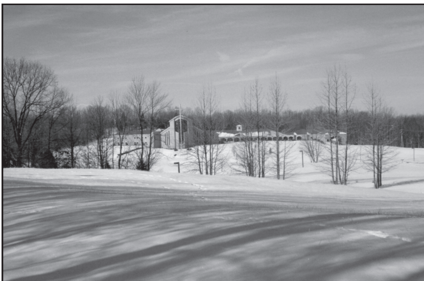
We do not have a desert but our monastery and chapel are located on 170 acres of woods and fields in which to venture into union with God.

Going out into a desert entails sacrifice. In monastic life we sacrifice the enjoyment of many good but unnecessary things for the sake of 'the one thing necessary.' These sacrifices prepare a space in our hearts so that we